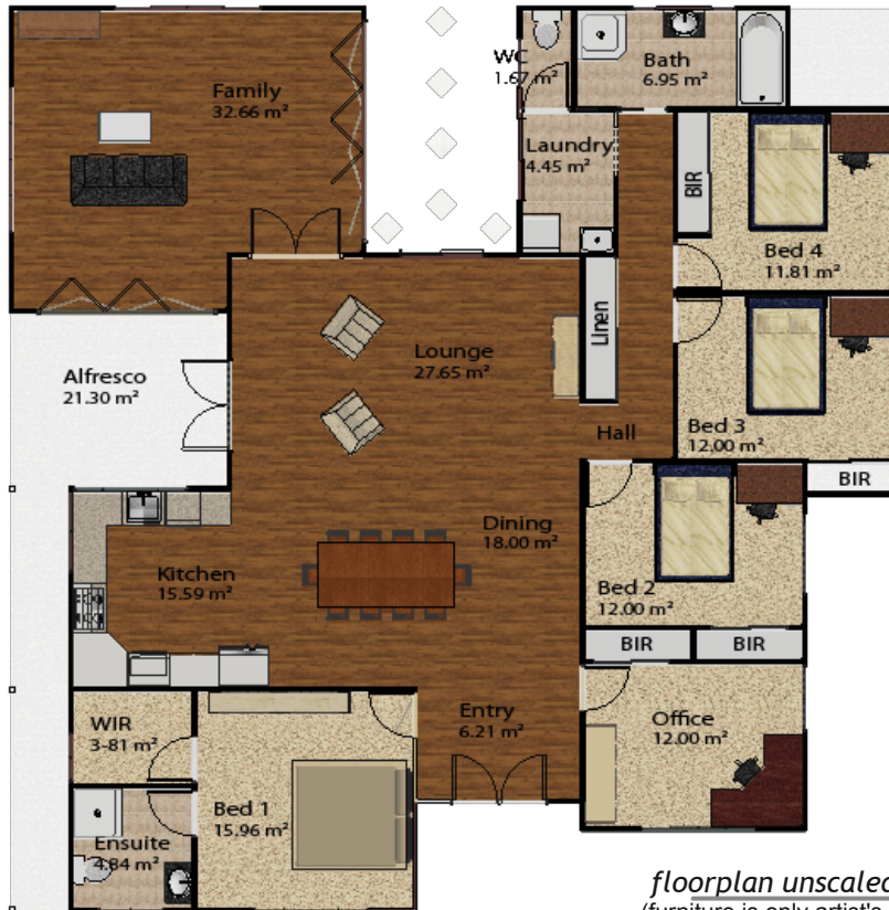
floorplan unscaled (furniture is only artist's impression)

Clean simple lines and different materials have been used to create the Capella. This modern design not only looks sleek but is practical for any family. With four bedrooms and an office that can be utilized as another bedroom this home is ideal for the growing and changing needs of any family. The hub of the home is the huge open living area. The separated family room is ideal for a home theatre system or games room. The Capella has something to offer everyone in the family.