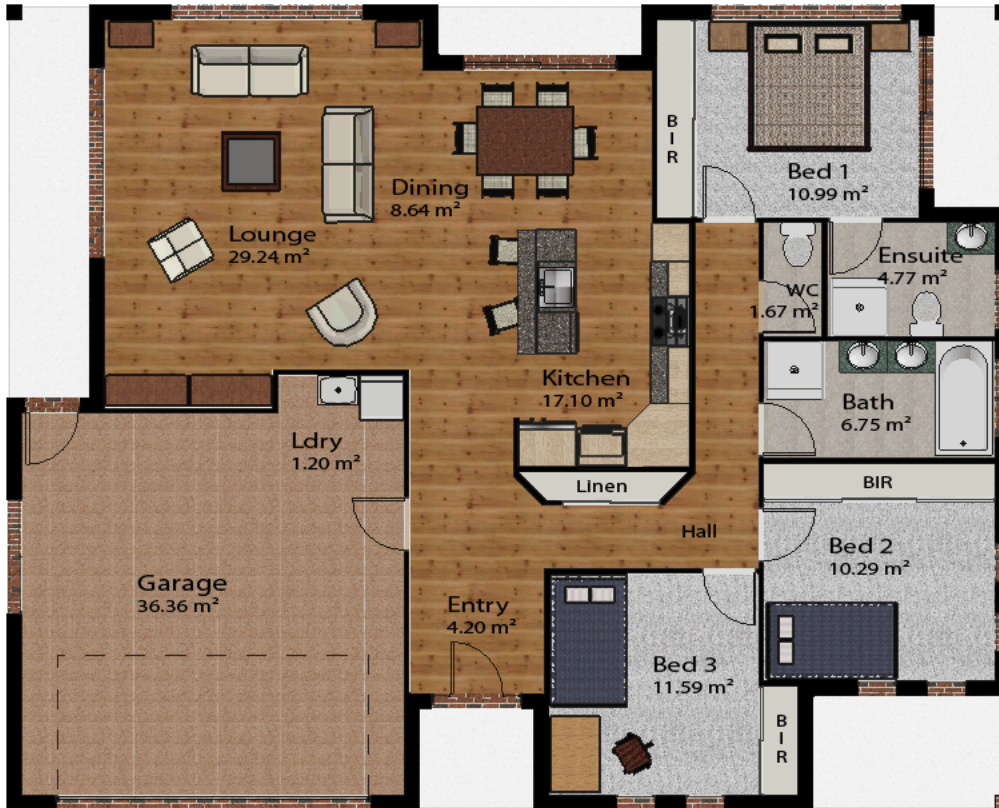
floorplan unscaled (furniture is only artist's impression)

The Barrington is a nice 3 bedroom home with an integrated garage. The asymmetric roofline features a modern design and turns a simple brick home into something special. The offsets in the facade open up the square floorplan and create covered outdoor areas which provide the space for private retreats. Use these spots to enjoy a cup of tea while you are reading the paper or just sit down and relax in the shade. The attached garage makes live easy. Only a short way to carry the groceries inside. The big bild-in-robos provide lots of storage space.