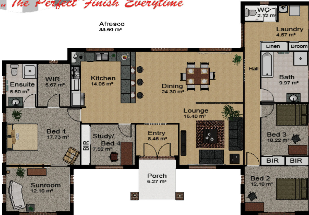
floorplan unscaled (furniture is only artist's impression)

The Woodford is a grand, majestic home. All the luxuries are prominent in this beautiful home starting from the entry foyer. The parent retreat offers the opportunity to be independent from the children. The sunroom is a wonderful place to chill out and watch your television programs or read without interruption. It also has an ensuite and walkin robe. This home offers 4 bedrooms with a study close to the parents retreat. The expansive alfresco area is the place to entertain friends and family.