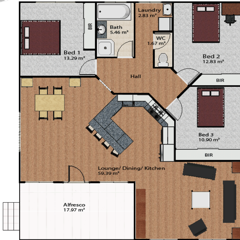
floorplan unscaled (furniture is only artist's impression)