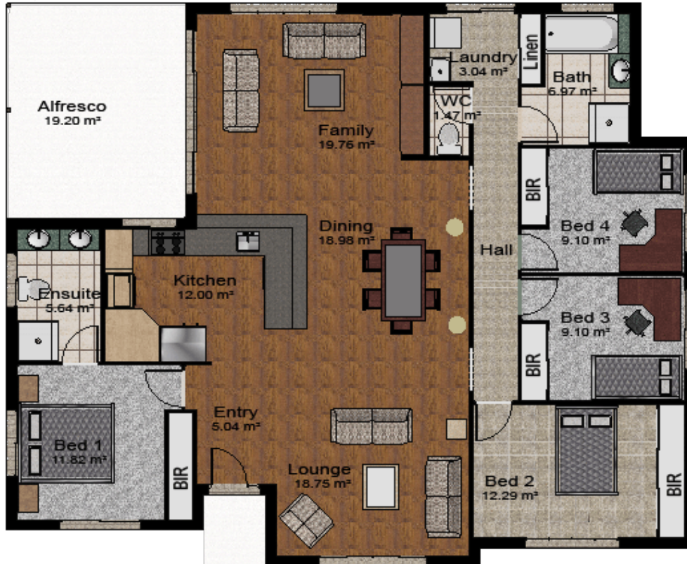
floorplan unscaled (furniture is only artist's impression)

The Everton is a 4 bedroom home with a large expanse open planed living area. This then opens out into the alfresco entertainment area. The main bedroom is separated from the other bedrooms for privacy and has an ensuite with a double vanity unit. Bedroom 2 is large and great for visitors staying for extended periods.