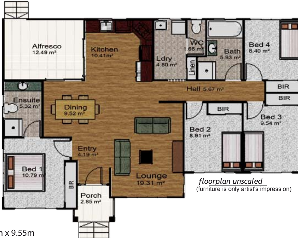
floorplan unscaled (furniture is only artist's impression)