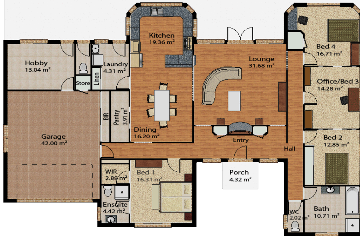
floorplan unscaled (furniture is only artist's impression)

The Arcacia is an adaption of the award winning „Willona“ Home. This home is so versatile and can easily change to the needs of a family as it grows. There is so much street appeal from the front of this home as the portico area steps in, encouraging you to come inside and take a look. With 4 bedrooms and a hobby room there is plenty of room to cater for a large family. Storage space is not a problem. Cupboards and built on robes are throughout the home. Looking at the alfresco area it is easy to imagine entertaining friends and family in this open expanse. Having the double garage with a remote control panel lift door is a wonderful plus. Protected from the elements this makes it so easy to unload the groceries and kids and is also great security for the vehicles as well. The Arcacia is a home that will suit for a lifetime.